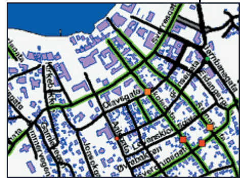
Visualisation of "black spots".